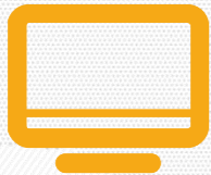
information technologies cluster