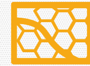
composite technology cluster